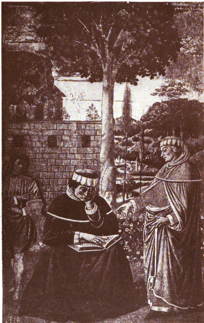
St. Augustine Reading From a fresco by Benozzo Gozzoli